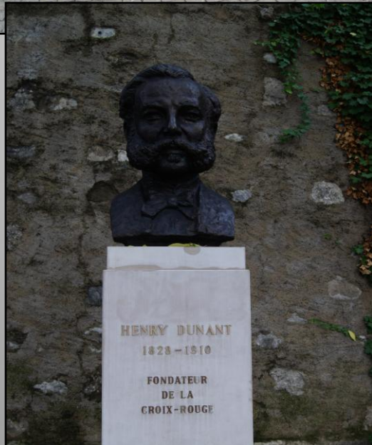
HENRY DUNANT 1828-1910 FONDATEUR DE LA CROIX-ROUGE